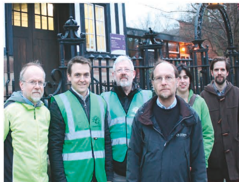
Green councillors in Liverpool are fighting to save the city's libraries from the axe.