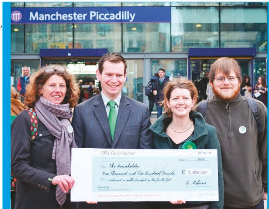
Green Party European Election candidates pose with a giant cheque for £1,500 – the average cost of HS2 per UK household.

The full report is available online at :- northwest.greenparty.org.uk/campaigns